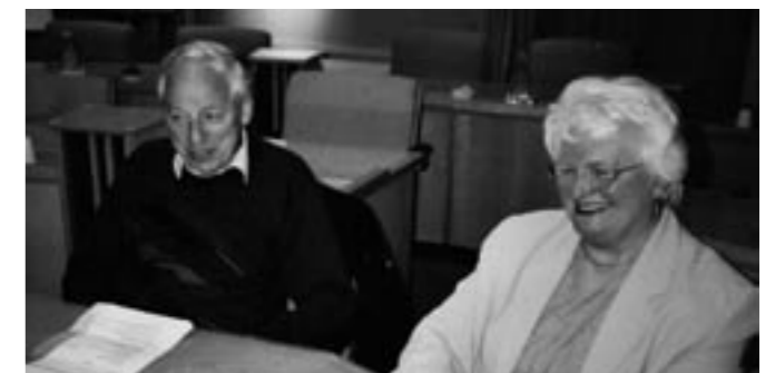
Two of our Members

The counties of Surrey and Sussex are a pilot area for patient choice, which offers patients currently waiting in excess of six months for general surgery and urology the option to receive treatment at an alternative provider. This initiative is to be rolled out across all specialities from April 2004.