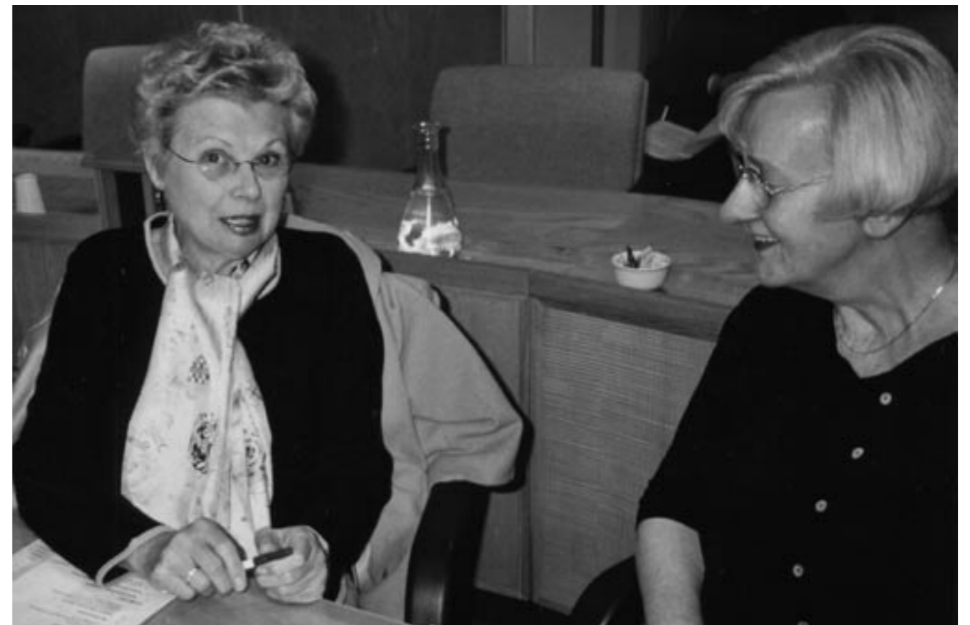
Two of our Casualty Watch Members

A strategy for substance misuse services "The Way Forward" was agreed in 2000. Locally more education on substance misuse and an improvement in accessibility to these services is required.