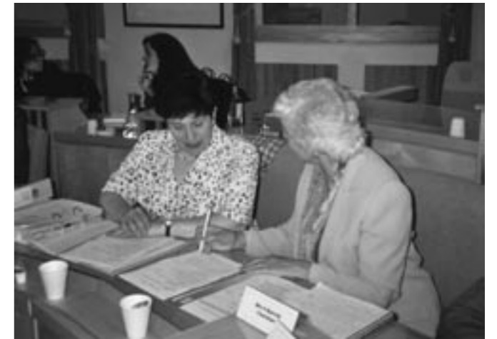
Chief Officer and Chairman

The Community Health Council has received a number of papers on organisation of emergency care and wishes to see this translated into action for the benefit of patients.